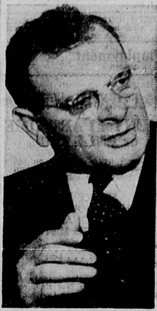
Sidney Hillman (above), labor leader, has been accused by Radio Commentator Fulton Lewis Jr. of leading the strikes for higher wages while the men at the front are fighting for $50 a month in foxholes, and wants the government made to order for his purposes.

In urging enlistments in the State Guard, Governor Warren in an appeal to cities and counties recently wrote: "You need not be told that we have a grave responsibility. California is nearer to the battle lines and more important to the conduct of the war by reason of our vital natural resources and war industries than almost any other state. It is our job not only to protect this arsenal of war, but also to protect our own homes."