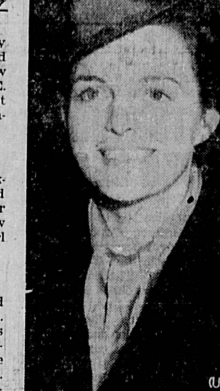
Attractive Helen Gahagan, wife of Actor Melvin Douglas, is the Democratic alternate for GOP'S Claire Booth Luce. Mrs. Douglas is a staunch Roosevelt supporter, is a member of the California State Democratic Committee.