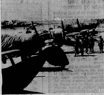
A flight of Jap Zeros on edge of Asilo airfield, Salpan, when Yanks captured field with such suddenness that Japs didn't have time to destroy them.