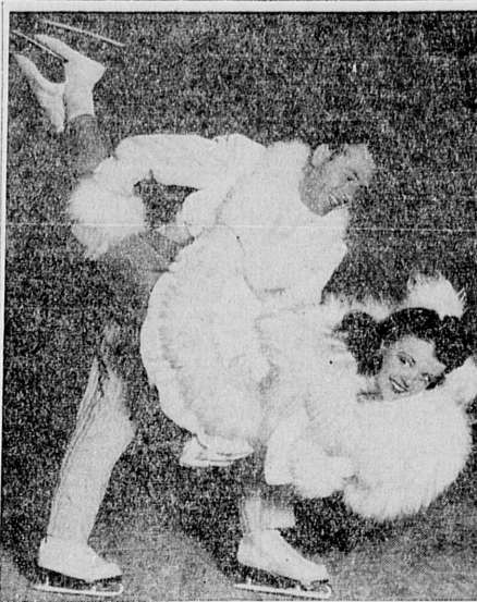
DONNA ATWOOD... 19-year-old Los Angeles girl, coming to the Pan-Pacific auditorium with the "Ice-Capades of 1944," which opens its big engagement here on April 27. She turned professional after winning junior national amateur skating honors in 1938 and performs feats of skill never before done by a skater so young.