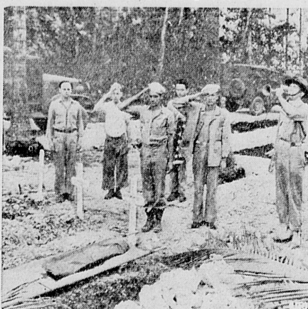
Fighting men pay respect to memory of fallen buddy somewhere in Solomons. Stretcher lies over his grave and plain white cross marks his resting place, as bugler blows "Taps." Grave is in corner of an American cemetery.