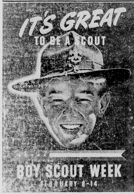
More than 1,600,000 Boy Scouts, Cubs and their adult volunteer leaders will observe Boy Scout Week, Feb. 8 to 14, marking the 34th anniversary of the founding of Scouting in the United States. In 1910, more than 11,100,000 American boys and men have joined the "It's Great to be a Scout!"