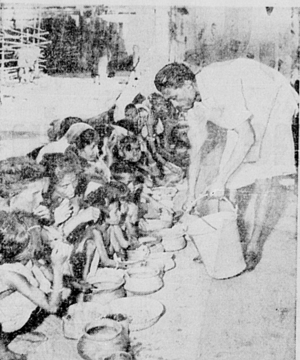
Starving Indians in Calcutta greedily thrust food into their mouths, as they fed on sidewalk. Homeless army of 100,000 roamed the city, while an estimated 1,000,000 more died of starvation.