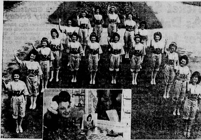
Above: Helene Hughes dancers line up in "A" formation.

THE RAILROADS ARE THE BACKBONE OF OFFENSE