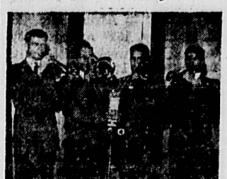
BRASS QUARTET—Appearing Sunday at Central Church.