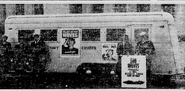
LAND-GOING CRUISER - Crew seeks "Wave." "Spar" and Navy recruits in Harbor area.

More than 86 million moto vehicles have been produced i the United States since 1900.