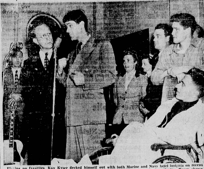
Planing no favorites, Kay Kyser decked himse visit to Navy Hospital at Mare Island, where