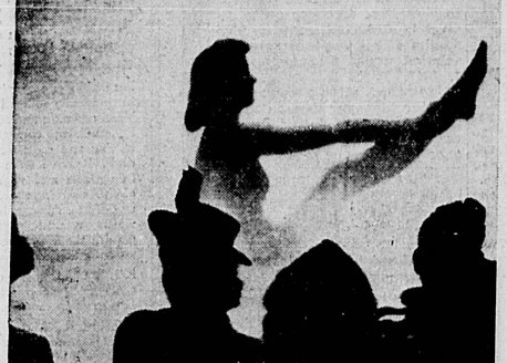
Picture to the contrary, Londoners are not all out for burlesue. This is all part of highly graphic lecture on how to save fuel and water. Behind screen of downtown department store window, young lady demonstrates how to bathe without waste of precious hot water.