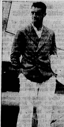
Howard Hughes, wealthy young flyer, who has broken cross-country records and designed outstanding planes, will collaborate with Henry J. Kaiser in execution of Kaiser's plan to build 500 huge transport planes. Hughes will probably design the cargo ships.