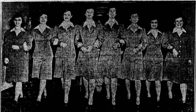
WAR WORKER GIRLS IN UNIFORM—Eight young women employees of the Philadelphia Ordnance District Headquarters are shown in their new uniforms which they designed and purchased with their own funds. Wearing of the uniform is optional, but many girls prefer it because it is practical and military in appearance.

Mr. Sunday S. O. Monte. Rhul nose 2,000 era.