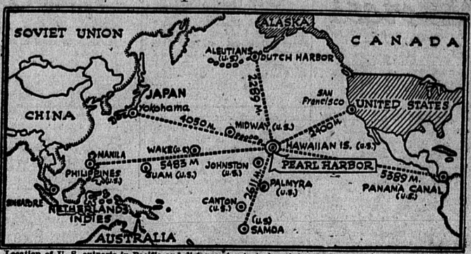
Location of U. S. outposts in Pacific and distances to strategic points are shown on this map. Renewed plans to fortify Guam are "provocative," according to Japanese, but Washington seems intent on proceeding nevertheless. British are pouring thousands of Australian troops into vital Singapore. U. S. has moved fleet units from Honolulu Navy base to Manila.