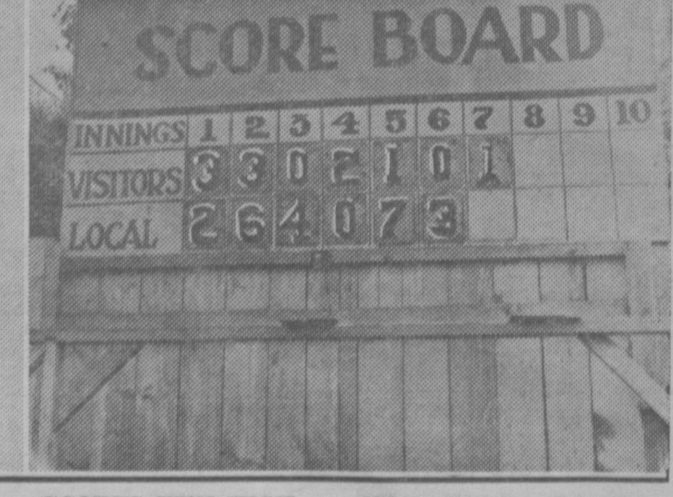
. Almost every day "HE'S ZOUT AT TH' PLATE!" finds the city ball diamond in use by Torrance youngsters who, as these photos show, take their baseball seriously. They are being well coached.