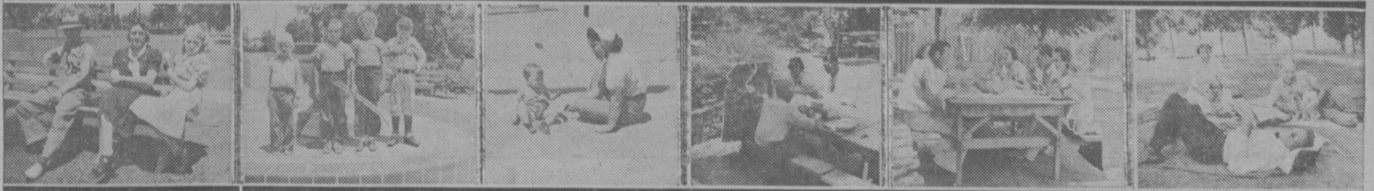
RESTING . . . Park benches invite you to "take it easy." POSING . . . After a hard game 'just like reg'lar guys!' SUNNING . . . Girls and boys bask in sun. BRIDGING . . . Shady park spots invite talk. PICNICKING . . . Is a favorite sport for local folk. LOLLING . . . Around in peace and quiet is restful.