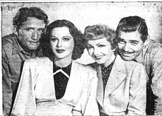
STARS PACK ACTION DRAMA... Spencer Tracy, Hedy Lamarr, Claudette Colbert and Clark Gable as they appear in "Boom Town," opening Sunday at the Grand theatre for a four-day run. This

50 Personal Christmas Cards and Envelopes imprinted with your name, $1, cash in advance. Torrance Herald or Lomita News.