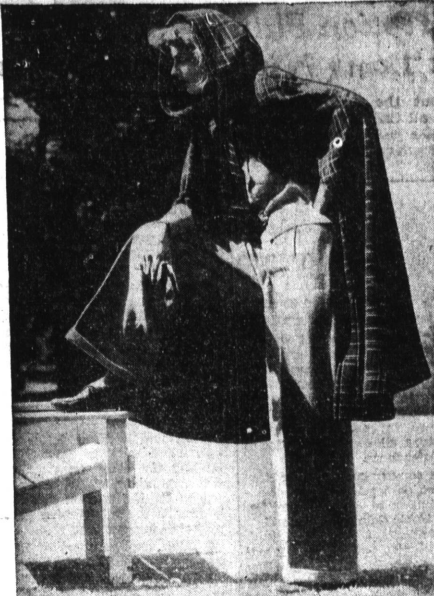
For campus or country, for motoring or autumn sports, this cape will be the friend of your life. The red shades are in wool plaid. Harper's Bazaar urges a meeting between women who wear slacks and the type pictured, or soft beige camel's hair, made with a two-zipper front closing that keeps them snug and smooth over the tummy.

Adjudicated a Legal Newspaper By Superior Court, Los Angeles County.