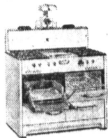
A WEDGEWOOD CP gas range with an extra-deep broiler—especially good for fowl and small roasts. Oven is extra-large, with accurate heat control that enables you to bake with any temperature you need. This model, with clock and light, after allowance, $110. Others as low as $79.60 after trade-in.

This offer is good for a limited time only. So call on a dealer or your gas company right away! See the latest models of CP gas ranges. They're lovely—and they cook as well as they look!