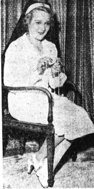
History repeats itself in these pictures of Mary Pickford. At right "America's Sweetheart" is seen in an old picture from Red Cross files knitting sweaters for American soldiers in 1917, who were called "Doughboys." She was working on set of "Scraps" then. At left, as chairman of women's division of Red Cross drive in movie colony, Mary Pickford knits again, but not for American soldiers on foreign soil. Not yet, anyway.