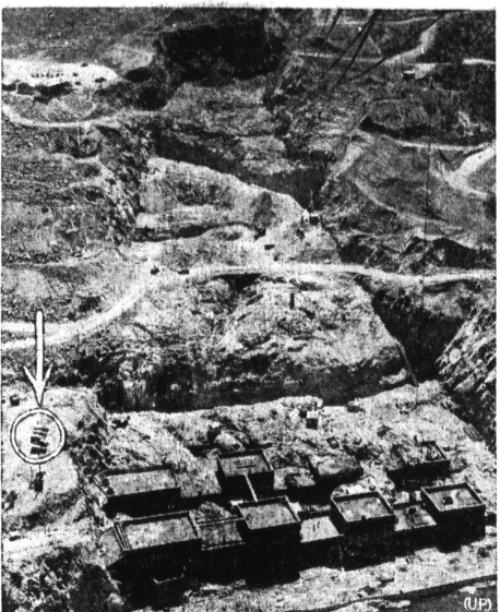
From top of cableway head lower, 700 feet above Sacramento River, this is way embryo Shasta Dam looks after 40,000 cubic yards of concrete have been poured. Six million cubic yards will be poured, under supervision of U. S. Bureau of Reclamation, in 50-foot square blocks which are raised in alternate rows in successive five-foot lifts. There are five trucks in arrow-marked circle at left, incidentally.