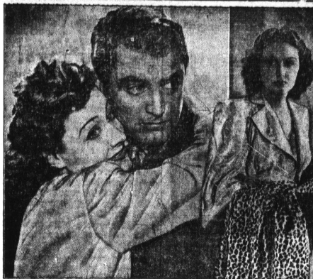
ONE WIFE TOO MANY . . . When that happens there's bound to be woe and confusion. And that's what Cary Grant experiences when he weds Gail Patrick (right), unaware that Irene Dunne, Wife No. 1, is very much alive. The situation is the groundwork for comedy in "My Favorite Wife," opening tonight at the Grand theatre.

SPECIAL ATTRACTION TONIGHT DOORS OPEN 6:00