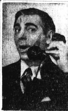
"HELLO, MA!" . . . Eddie Cantor is at the phone—probably telling the world he is starring in "The Story of Forty Little Mothers"—a delightful comedy attraction—which opens Sunday at the Lomita theatre.

Torrance resident 20 years, Taxpayer, Veteran, Union Member, Not just another politician.