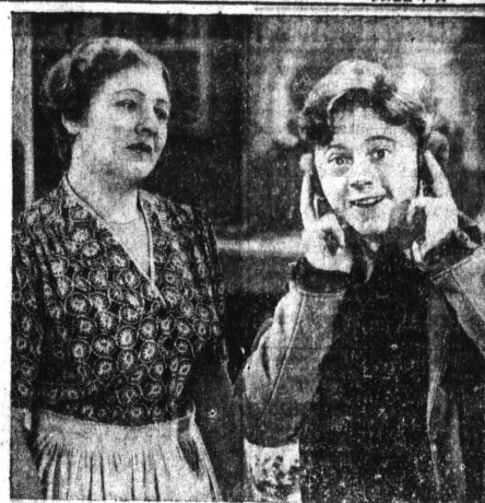
UP TO HIS TRICKS AGAIN . . . When Mother Hardy (Pay Holden) suggests that her starving son Andy (Mickey Rooney), leave a few doughnuts for the rest of the Hardy Family, Mickey finds a way of pretending he can't hear a word she says. The scene is from "Andy Hardy Meets Debutante," opening Sunday at the Plaza theatre in Hawthorne.