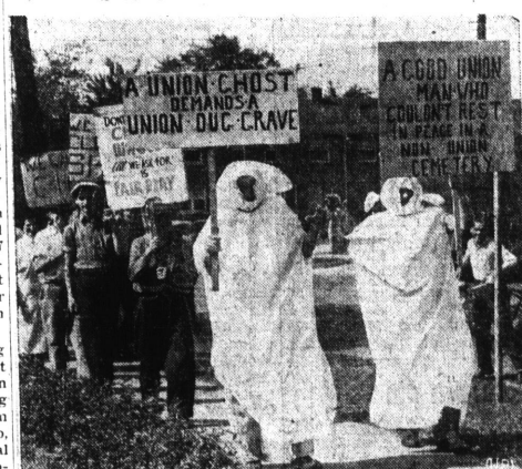
In strike for better wages, Detroit grave diggers put on this ghost act to dramatize their demands while picketing cemetery gates. Strike halted some burials.