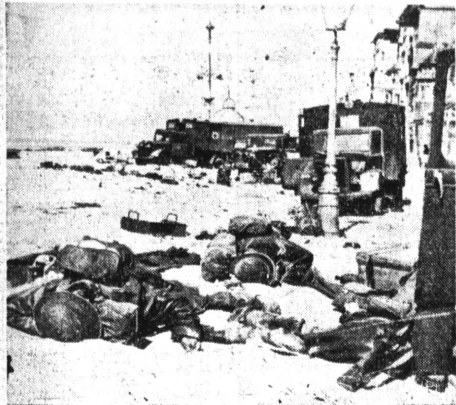
This is one of the few casualty pictures released in European war. Just released by German censor, it asserts shows British soldiers dead beside their motor lorries, in retreat from Flanders.