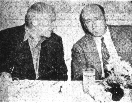
The famed De Mille brothers, rarely photographed together, are seen in Paramount commissary during lunch. William C., retired producer-director (right), has just written his memoirs. Cecil B. is the other one, in case you don't remember.