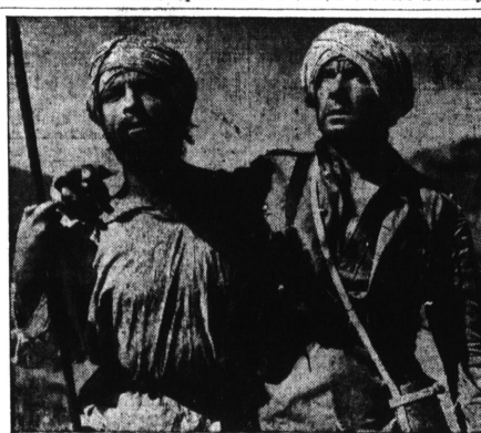
SPECTACLE IN COLOR . . . John Clements and Ralph Richardson trekking over the hot sands of the Sudan desert in a dramatic scene from the Technicolor adventure spectacle, "Four Feathers" which opens Sunday at the Torrance theatre.