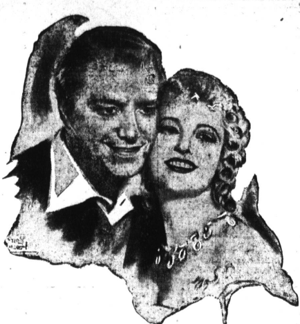
SWEETHEARTS AGAIN . . . Jeanette McDonald and Nelson Eddy, the screen's favorite singing duo, are together for the sixth time and more thrilling than ever in "New Moon" which opens at the Grand theatre Sunday.