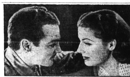
TWO PARTS OF TRIANGLE . . . James Cagney is quite the gay Lothario in "Torrid Zone," which opens Sunday at the Lomita theatre. Heart-interest in the "triangle" thriller of the tropics is Ann "Oomph Girl" Sheridan and Pat O'Brien.