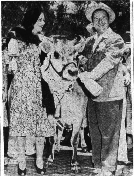
HOLLYWOOD WELCOMES "ELSIE" ... "Elsie," record-producing cow exhibited at New York World Fair, got a real celebrity's welcome by stars (including Kay Francis and Jack Oakie) when she came to Hollywood to play role of "Buttercup" in a movie. Festivities were topped by lawn party, in honor of "only actress who ever admitted she was a cow."

The Golden Gate Turf Club's proposed new horse racing track at Albany—third in northern California—has received tentative approval of the State Racing Commission.