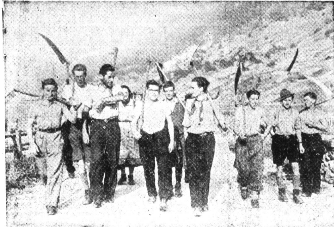
YOUNGSTERS HARVEST CROPS . . . All over Europe, farm work these days is done by women, old and disabled men, and

During the same period, however, expenditures by the state government showed a greater increase and continued far ahead of revenues. The expenditure figures were $191,222,096 for the 11 months of 1939-40 and $179,956,836 for the 1938-39 period.