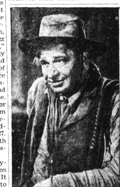
WALLACE BEERY . . . who with Leo Carrillo and Marjorie Rambeau head the list of favorites in "20 Mule Team," opening at the Lomita theatre tonight.