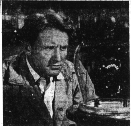
WIZARD OF MENLO PARK . . . Spencer Tracy, in the outstanding role of his brilliant career, recreates the life of the great inventor in "Edison, the Man," which opens tonight at the Grand theatre. On the same program is "Typhoon" in color featuring Dorothy Lamour.

Appropriations approved by the city council Tuesday night totaled $873.10. The items were: For 50 glass ornamental light globes, $450.25; for road materials to repair 233rd street to Narbonne avenue, $196.45; for janitors' and cleaning supplies, $226.40.