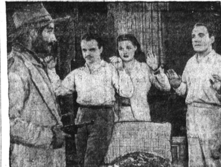
TROUBLE IN THE TROPICS . . . James Cagney, Ann Sheridan and Pat O'Brien face the business end of George Tobias' gun in this scene from "Torrid Zone," which opens at the Plaza theatre in Hawthorne on Saturday.

Counterfeit Coin Elusive KINGFISHER, Okla. (U.P.)—The Kingfisher firemen burned off the lawn of the First Christian church here to find a counterfeit half-dollar. The search was futile. The coin was sought by police as evidence. Witnesses said a suspect threw something on the church lawn that looked like silver money.