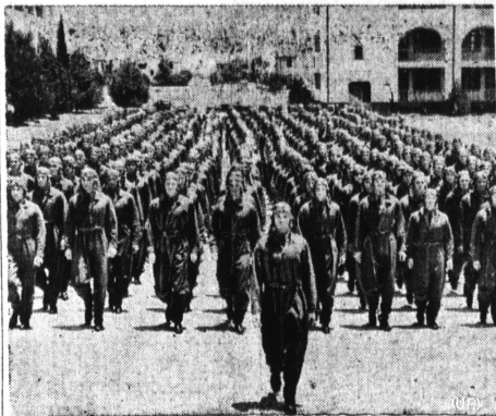
TRAINING FOR NEW AIR FORCE... Cadets of basic training school at Randolph Field, Texas, march in drill formation. Army plans to train 7,000 air corps officers annually.

Correcting an earlier announcement, the SRA said this week that relief clients will be paid on July 3 at the store, 1215 El Prado, instead of July 5 as first reported by SRA officials.