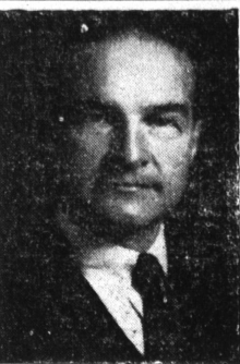
NEW STEEL HEAD ... Irving Sands Olds, newly-elected chairman of the board of the U. S. Steel Corporation is a native of Pennsylvania, graduate of Yale and Harvard and former secretary to the late Justice Holmes of the U. S. Supreme Court.

Read these few simple rules: 1. Write a four-line rhyme based on some classified advertisement which appears on the regular classified pages of The Herald and News. Your verse must concern some particular ad—not classified ads in general. (Be sure to see rule No. 5.) 2. Write on but one side of the paper, and be sure to paste a clipped copy of the advertisement about which you write on the same side of the sheet—preferably above the rhyme. 3. Date each rhyme you send in. 4. Print your name and address in full and mail your verse to the "Classified Ad Rhymes Contest Editor," Herald-News Office, Torrance, Calif. 5. You may write more than one rhyme at a time (as many as there are ads if you wish) but each one must be on a separate sheet of paper and on a different ad each time. You may write each week on the same ad, if you desire.