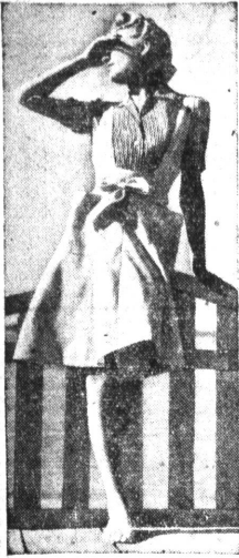
BEACH PREVIEW . . . Something new in the way of pinaflores is this one of white cotton pique, tailored, with jutting pockets.

M. E. COUNCIL LUNCHEON PROGRAM M. E. Council will entertain with a dessert luncheon and program at the church parlors Tuesday afternoon, June 11, at 1 p. m. The public is invited. Tickets at 25 cents may be secured at the door. A feature of the program will be the presentation of the P. T. A. choir which will sing a group of numbers.