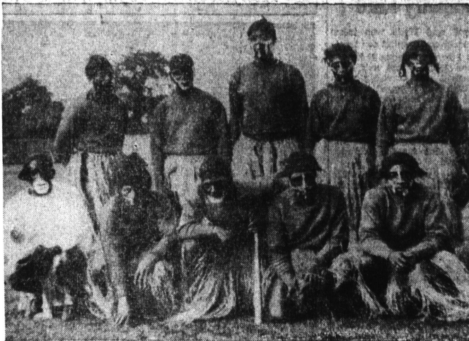
ZULUS ARE COMING TO TORRANCE

Narbonne's varsity defeated Gardena, 78 to 26, last Friday. The Gaucho Bees also won but the Lomita Cees lost to Gardena in the final dual meet of the season.