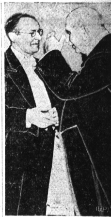
"ONLY 30 DAYS" . . . Lord Lothian, left, British ambassador to U. S., chats with J. P. Morgan at New York dinner, after asserting that "30 days" might decide fate of dictatorships.

Paid While Training A unique feature of this program is the course is a valuable one, its worth being conservatively placed at $15,000, and that the individual is well paid throughout his training and period of active duty. During the nine or ten months of flight instruction at Long Beach and Pensacola, the pay is approximately $110 per month. In addition, uniforms, medical and dental care and $10,000 life insurance policy are furnished. After graduation from the Navy's Air College at Pensacola, the Reserve Aviator receives more than $200 per month while in active service with the navy. Applicants must be American citizens, unmarried and between the ages of 20 and 27 years.