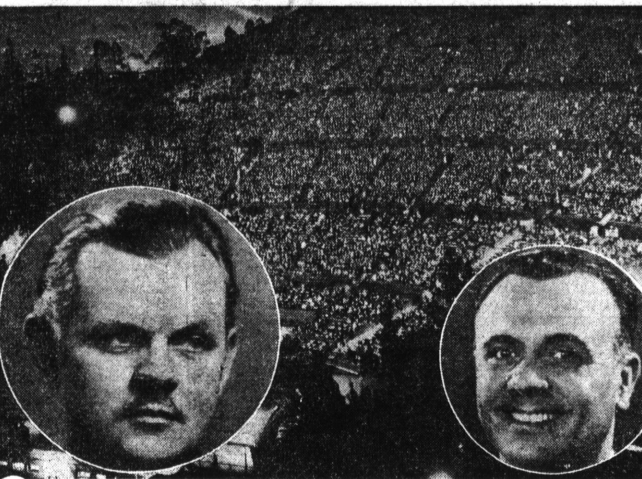
Glamorous Hollywood Bowl where 20,000 persons hear great symphonies and renowned artists. Inset left, Lawrence Tibbett; right, Jose Iturbi, conductor.

World famous Hollywood Bowl opens its 19th season of Symphonies Under the Stars July 9 with the celebrated Lawrence Tibbett, Metropolitan Opera baritone, as the stellar attraction. A native of California, Tibbett has been acclaimed one of the finest singers of