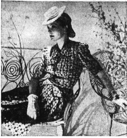
SUMMER in town, not easy to take, but this daisy (literally) figured dress and jacket of green rayon jersey is good defense against the heat. A feature in the May Harper's Bazaar, the "casual life" issue.