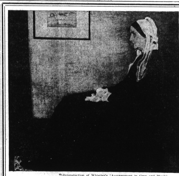
Reproduction of Whistler's "Arrangement in Grey and Black"