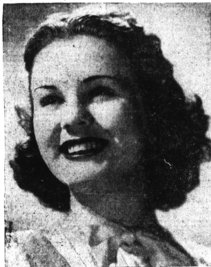
The radiant beauty of youth such as DEANNA DURBIN has, is desired by all women and cherished by all men.