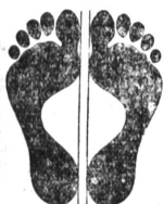
GOOD FEET ARE THE FOUNDATION OF GOOD HEALTH

and Leave Foot Troubles Behind You! Lightweight! No Metal! Inter-changeable in Shoes!