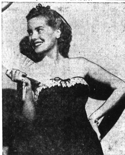
So meticulously turned out is attractive BRENDA JOYCE that she has the poise of a queen! And her beauty is radiant.