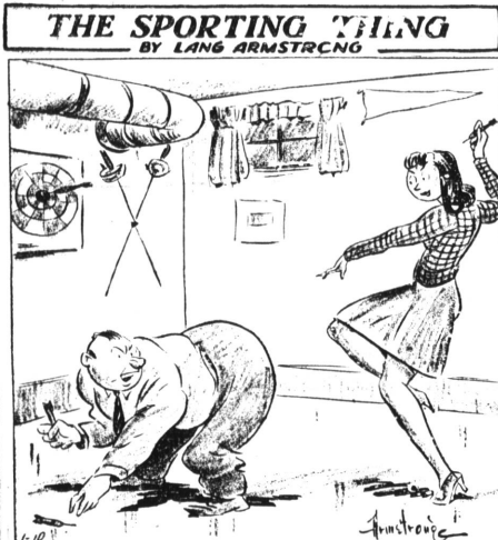
My only objection to this game is that nothing unexpected ever happens!