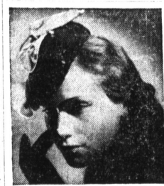
A PARIS import is this draped in a turban of black silk jersey, with open crown and two blue ribbon bows, received by Harper's Bazaar and appearing in the March 15th "Paris" issue.