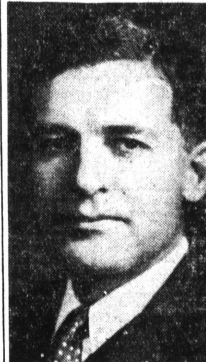
JOHN F. DOCKWEILER

During his years in Congress, Dockweiler, who began his career in law in Los Angeles in 1922 after graduation from U. S. C. in