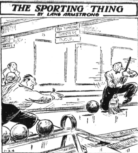
Hey! Will you please forget that you used to be on a curling team!

Wooldridge Herald-News Circulation Mgr. Writes Attentive listening is the main ingredient to being well-informed.