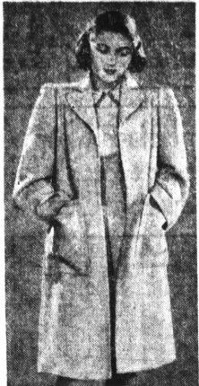
No miss will be amiss with this mammoth-pocketed coat in pink, blue or natural wool monotoner. Or even navy or black sheer wool. April Good Housekeeping suggests that for the young ladies whose bonus object to carrying primping apparatus, the pockets are the answer to a happy evening.