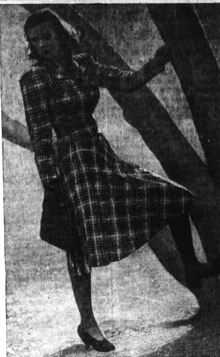
Spring of 1940 is due to witness a riot of color according to Harper's Bazaar. The gay and daring are advised that sulphur yellow and electric blue are the colors in this happy but loud-plaid wool. It can be worn with a soft pull-over or with a blouse.

YOU CAN GET THEM ALL FROM— EDWARD G. NEES CONTRACTOR 1601 Gramercy • Ph. 154 Torrance, Calif.