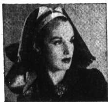
For the starry eyed ones Harper's Bazaar presents a new colf in brilliant colors. Fundamentally it is white straw with a narrow, vermilion band and wide fringed streamers of royal blue taffeta that tie in a wide flat bow in back.

Write a Rhyme on any Classified Ad and get in on the $125 in cash and merchandise prizes.