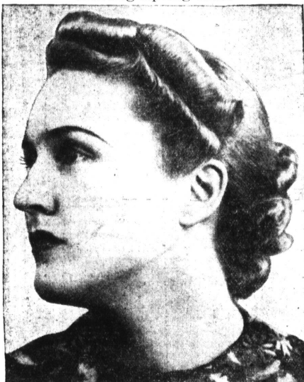
This is a sleek coiffure for the woman who wishes to wear smart hats. It may be combed out softly for evening wear.

Hair Stylists and Milliners Get Together in Creating Spring Hats