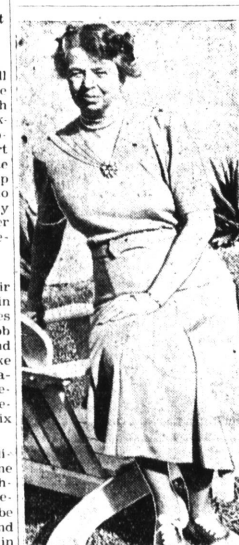
TAKES REST... Mrs. Franklin D. Roosevelt poses for photographers at Miami Beach, Fla., where she is resting for a month.