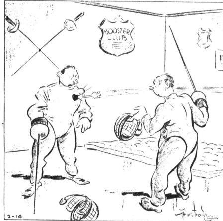
Somebody is carryin' this Valentine stuff too darn far!