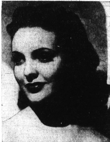
Heavy brows with natural arch add much beauty to LINDA DARNELL'S eyes. She keeps them nicely groomed.