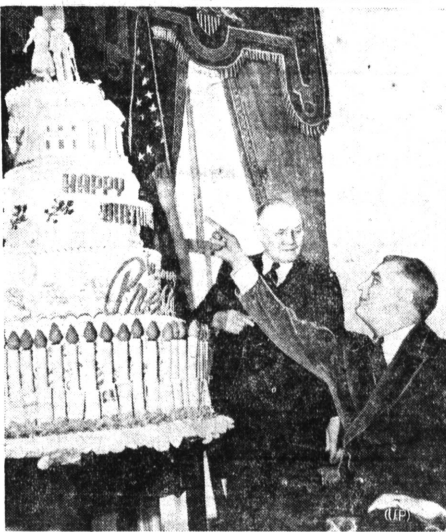
CAKE FOR PRESIDENT'S BIRTHDAY . . . William Green, head of the American Federation of Labor, with 400-pound cake his organization presented to President Roosevelt for the chief executive's 58th birthday on Jan. 30. Green is telling Roosevelt each candle bears $100 check for paralysis fight. Meanwhile, President John L. Lewis of CIO was denouncing Roosevelt and New Deal.