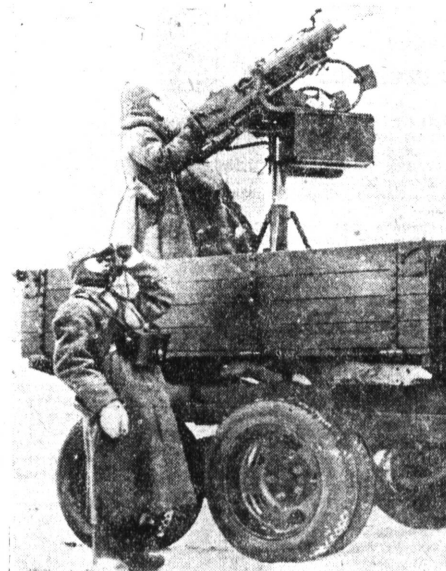
REDS MAN AIR GUNS . . . Although Soviets bar U. S. correspondents and cameramen from Finnish fronts, this Moscow picture shows Russia has latest-type anti-aircraft guns. These soldiers are operating a three-barrel gun, similar to British "Pom-Pom." Weapon hurls virtual rain of bullets, is most effective against low-flying strafing planes.